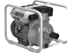
2" - 4" PWP Water Transfer Pumps