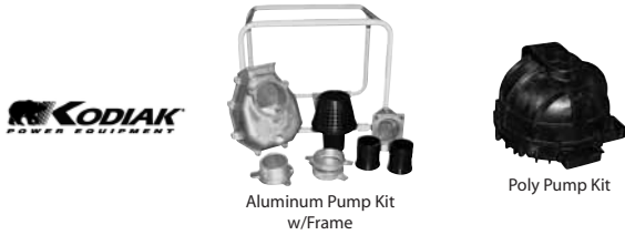
Aluminum Pump Kit w/Frame