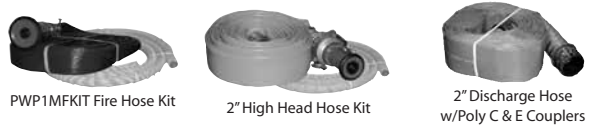
PWP1MFKIT Fire Hose Kit