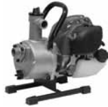
1" PWP Water Transfer Pump.