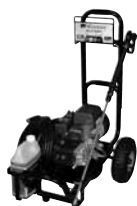
Reversible Cart Design on KC2100EPC and up